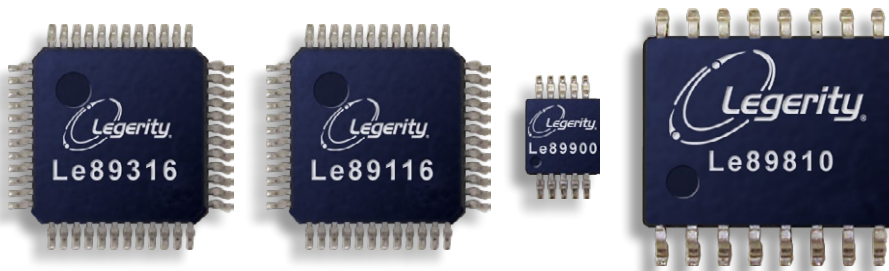
Not actual size

The VE8910, VE8901, VE8911, and VE8921 chipsets are highly integrated, cost-effective FXS, FXO and FXS + FXO chipsets that are optimized for residential VoIP access devices. These chipsets implement a complete BORSCHT functionality by providing the necessary voice interface functions to connect to, and power, one or more telephones and an isolated Direct Access Arrangement (DAA) for connection to the PSTN. The VE890 Series chipsets significantly increase design flexibility, improve system performance, and reduce BOM costs. These chipsets are supported by the Zarlink VoicePath™ API-II™ (VP API-II), which enables designers to offer a single hardware design that is software programmable for worldwide markets.